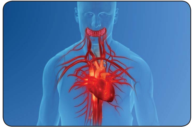
Oral bacteria and heart connection