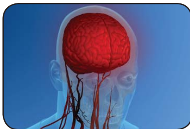
Plaque clot causes a stroke