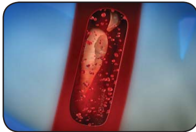
Plaque breaks off in carotid artery