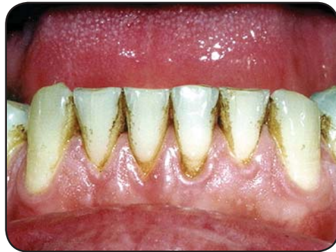
Smoking contributes to gum disease