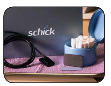
Digital x-ray sensor and plate