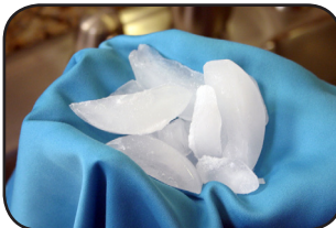
Use an ice pack.