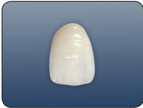
A translucent porcelain shell