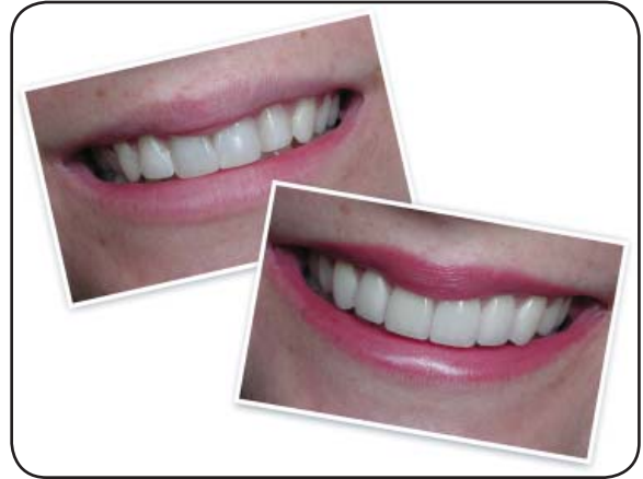
A dramatic improvement

A veneer is a thin shell of porcelain or plastic that is bonded to a tooth to improve its color and shape. A veneer generally covers only the front and top of a tooth. Veneers can be used to close spaces between teeth, lengthen small or misshapen teeth, or whiten stained or dark teeth. When teeth are chipped or beginning to wear, veneers can protect them from damage and restore their original appearance.