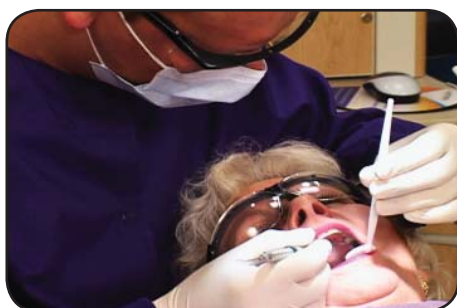
Scaling & root planing exam

The goal of scaling and root planing is to eliminate the source of periodontal infection.