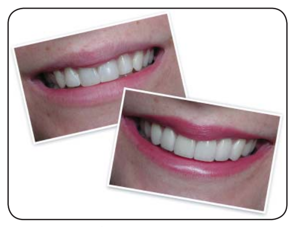
A dramatic improvement

A veneer is a thin shell of porcelain or plastic that is bonded to a tooth to improve its color and shape. A veneer generally covers only the front and top of a tooth. Veneers can be used to close spaces between teeth, lengthen small or misshapen teeth, or whiten stained or dark teeth. When teeth are chipped or beginning to wear, veneers can protect them from damage and restore their original appearance.