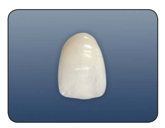
A translucent porcelain shell