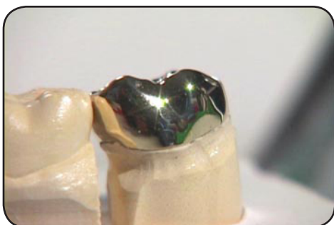
Gold crown placed on model

A gold crown has several advantages. The gold is soft enough to be gentle on the opposing teeth when you chew. But it's also very strong, so it withstands heavy biting forces, and gold is durable and long-lasting.