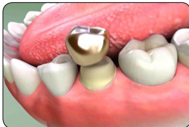
Placing gold crown over prepared tooth