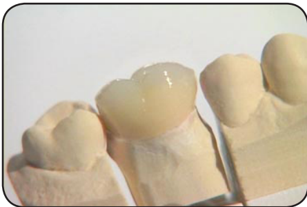
Porcelain crown placed on model

An all-porcelain crown has several advantages. It's strong and durable; it has the life-like appearance of natural teeth, and because there's no metal, it's a good choice for front teeth. The crown is precision-crafted in a lab, so it may take two or more appointments to restore your tooth with a porcelain crown.