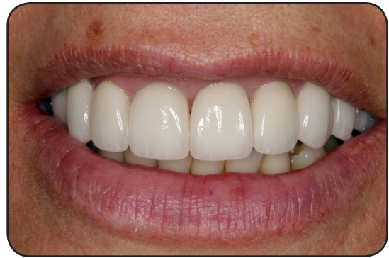
Porcelain crowns are natural looking